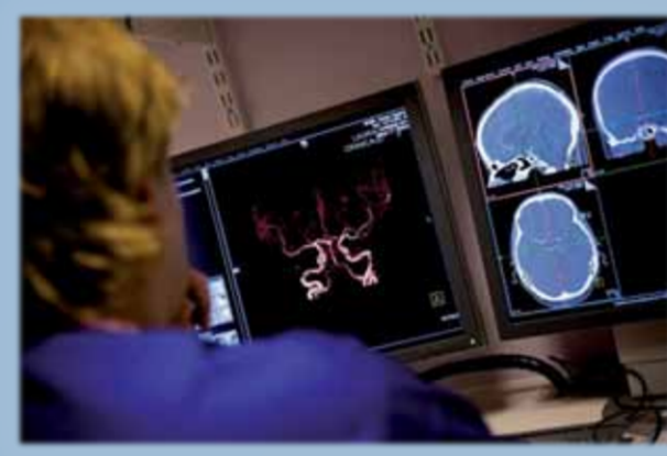
Patients receive expert care at Hyper Acute Stroke Units (HASUs) for up to 72 hours