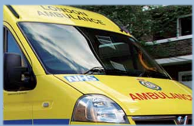
London Ambulance Service transports patients to HASU within 30 minutes