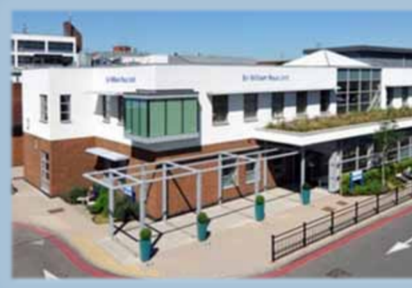
Patients are then transferred to local Stroke Units for longer-term care