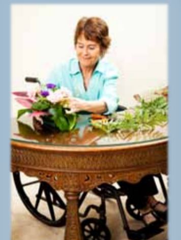
Regaining autonomy, control and a positive sense of identity following a stroke