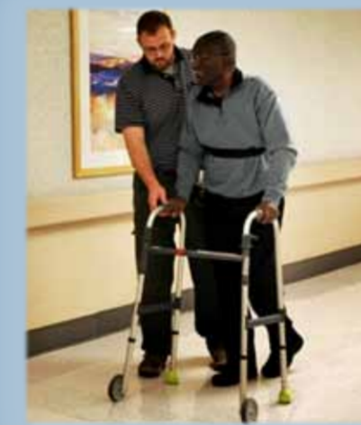
Following the acute phase, patients receive on going community rehabilitation services